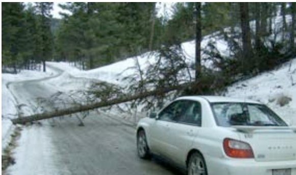
The picture can't show that the road surface is almost too icy to walk on

"Robbins Range" Regularity had a minor problem. 7.51km into the section, a power-pole-sized tree blocked the icy road.