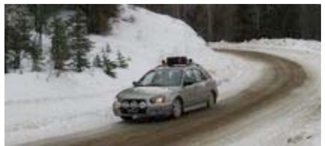
Steve Perret/Kathryn Hansen/Subaru Impreza

The second thing that changed turned the rally ... into a rout. Within minutes, less than half an hour, certainly, the wind had come up. It pressed on the trees, steady, and firm, and inescapable. It constrained whatever it touched, and captured whatever was loose. Sprigs of evergreens stripped from branches tumbled along the road. The falling snow marshaled into channels, and crashed in wintry rapids. Wherever the ground gave shelter, broad streamlined drifts were forming. Banks of snow in the air, thick as pea soup, moved over us and instantly blotted out our surroundings, then moved on as suddenly as they'd come. Dusk was approaching, though to this point we'd not turned up our lights.