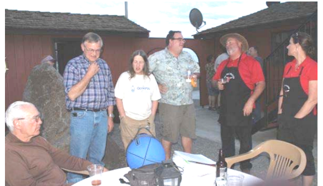
Saturday NA dinner. Various captions apply here. -ed

"We have a full day TSD Rally School July 6, 2013, and a 250 km 6 hour novice TSD rally on GRAVEL on July 7, 2013. Also, we are now doing only online registration and payment, and you can get to the payment page, with supp reg links, here. http://tinyurl.com/nt2vn2z "