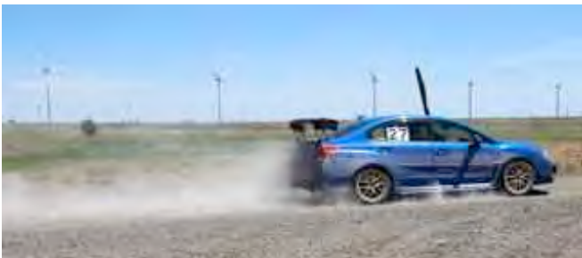
The 2015 Subaru STI of Yihai & Chang Xu had a wing. Interesting dust trail.

A neat part of No Alibi was the BBQ dinner on Saturday night. No entertainment was needed as the rallyists mingled. The rally ended at a Prosser city park. Scores were compiled (and time decs entered) while entrants compared notes, eating snacks that Rallymaster Dan Comden carried through the whole rally.