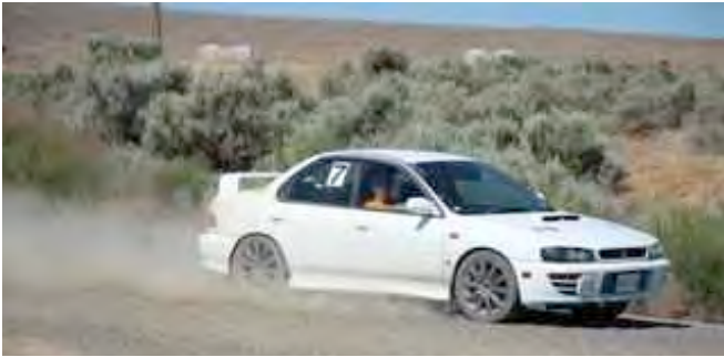
Last year they brought a blue one. This white Subaru of Bowie/Burgess is also right-hand drive.

got a GPS from Marvin, which was loaded with the CP locations. All he had to do was follow the GPS to get to the checkpoints. Downside was that upon arrival at each location, he had to stop and set it get to the next CP. It wasn't to last as he entered a sweeping right-hander on the first TSD. His 1990 Tacoma decided to roll off the dusty road. There wasn't a whole lot of damage, other than the canopy deciding to take a different route, and then self-destruct. Kyle picked up what tools had taken flight, then returned to Kennewick. The mirrors are OK.