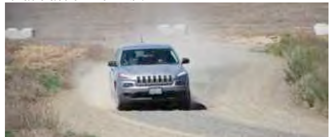
2014 Cherokee won the Novice class.