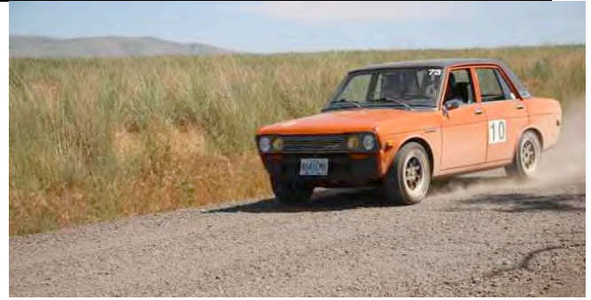
What's a rally without a Datsun 510?