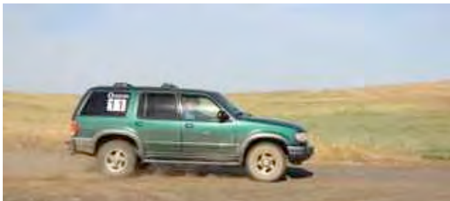
The winning Ford Explorer

Ten checkpoint crews found their way to remote locations, hoping to hide well enough that the competitors got the scores they deserved. Four crews volunteered to split up, dropping a "timer" off to hide in the scrub brush and parking the vehicle elsewhere.